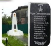
15. The monument to the heroes of the Great Patriotic War