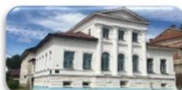
14. Music school (the former Nevskiy House)