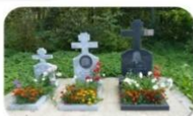
11. The Tombs of Tretyakov's family